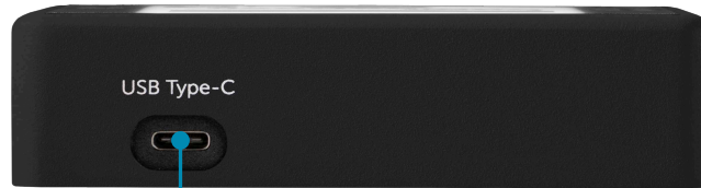
USB Type C Port