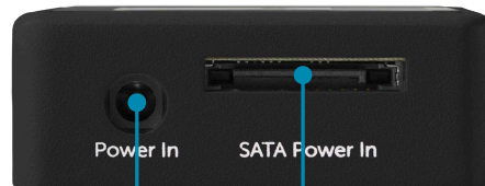
Power Supply Power Port